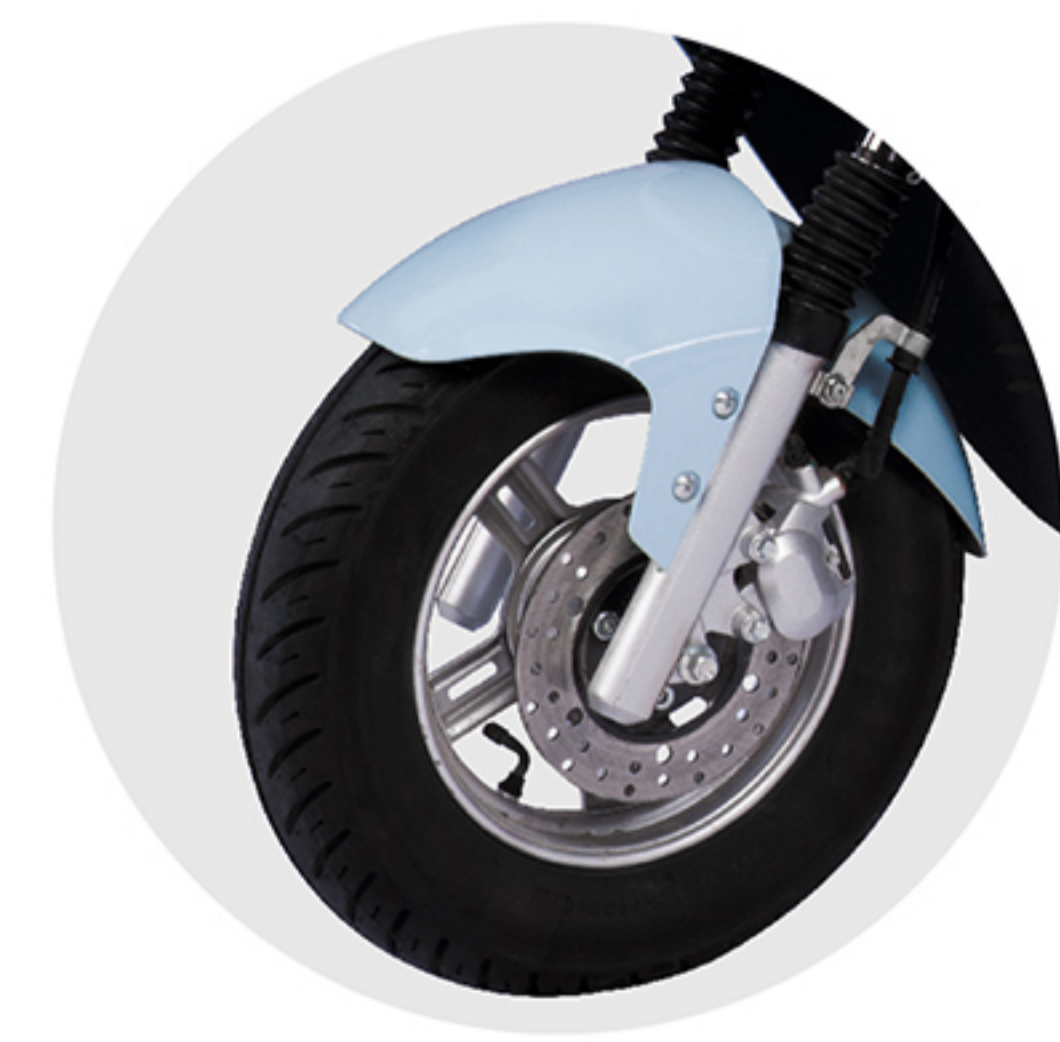
Front disc brake