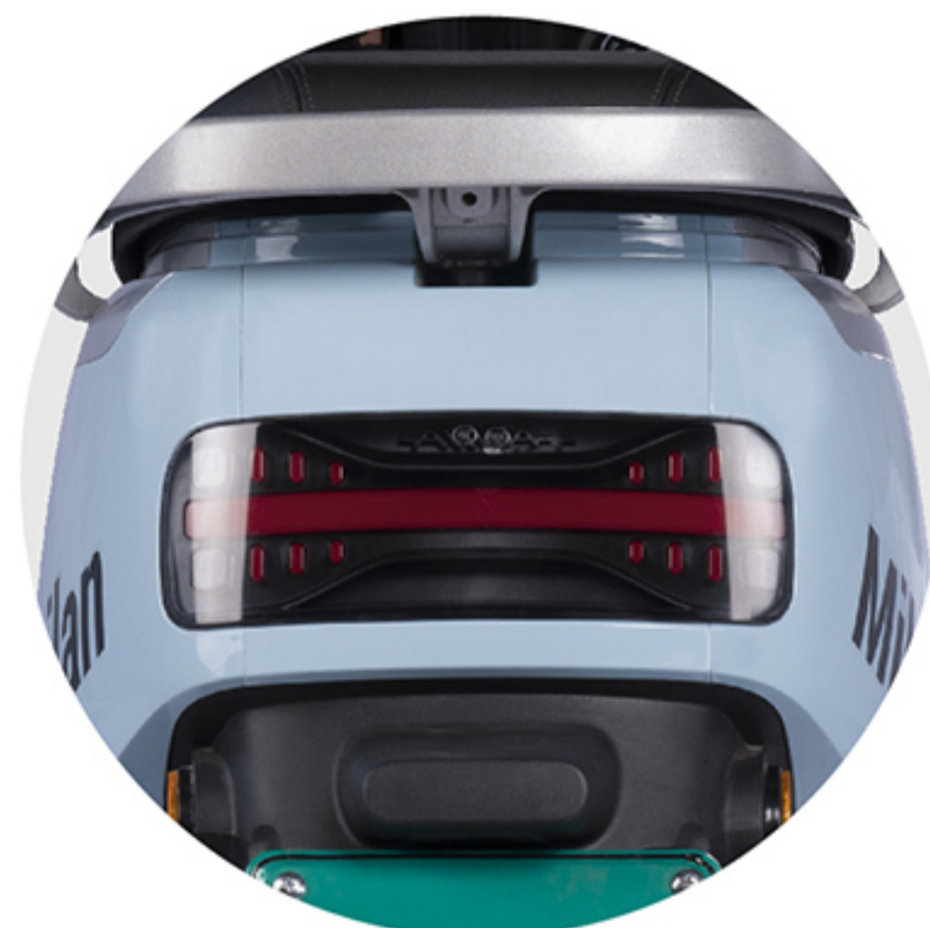
Gentleman collar end light