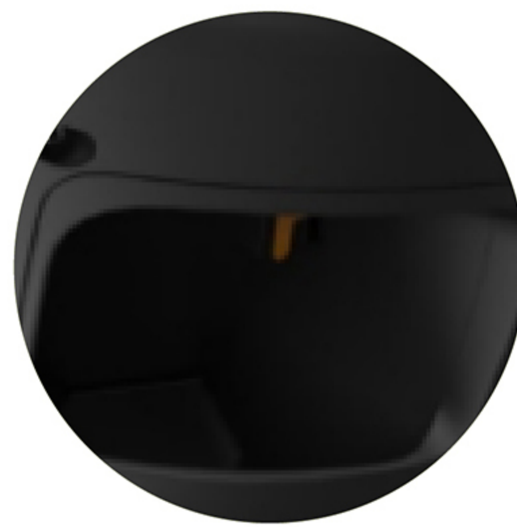
Open front storage compartment