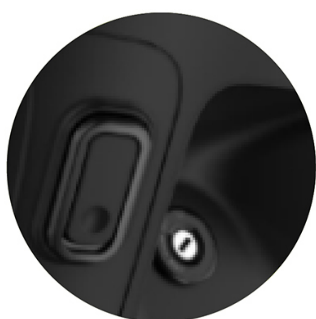
Flip hidden hook