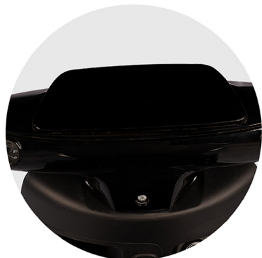
10-inch HD meter